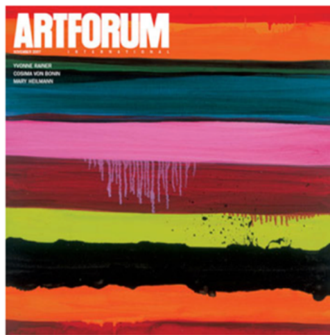
Carmelita (2004), cover, Artforum (November 2007)